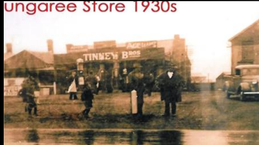
Ungaree Store 1930s